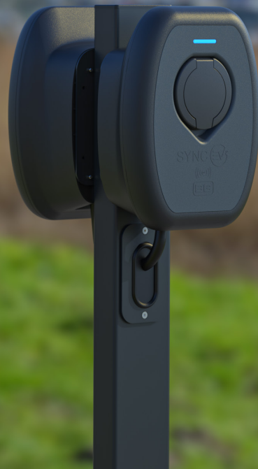
EVASTAND12T pictured with two EVS7GGR (not supplied)

Available as single or twin, suitable for BG SyncEV EVS (Socketed) and EVT (Tethered) models