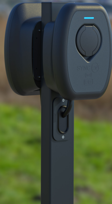
EVASTAND12T pictured with two EVS7GGR (not supplied)

Available as single or twin, suitable for BG SyncEV EVS (Socketed) and EVT (Tethered) models