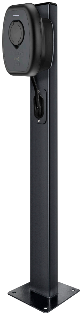
EVASTAND12S pictured with EVS7GGR (not supplied)